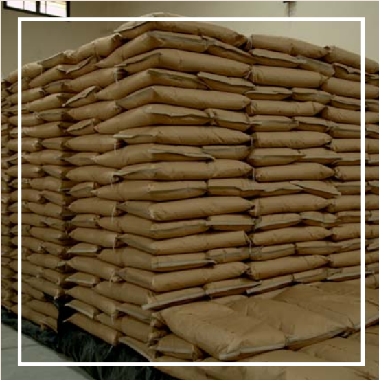
Finished Goods Storage Area