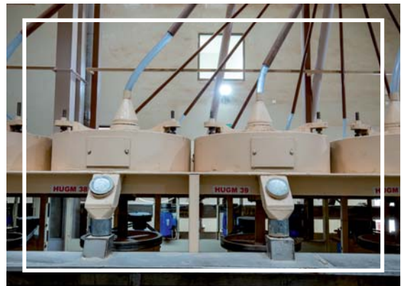
De Husking (Grinders)