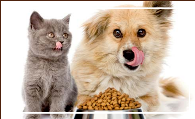
Pet Food & Pet Pharmaceutical Industry