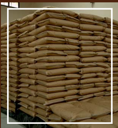
Finish goods storage