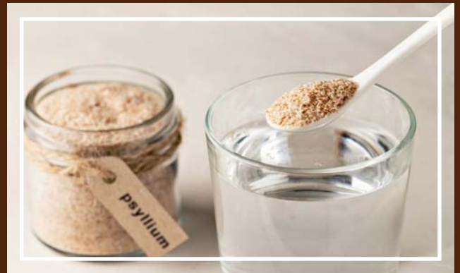
Dietary Supplement Industry