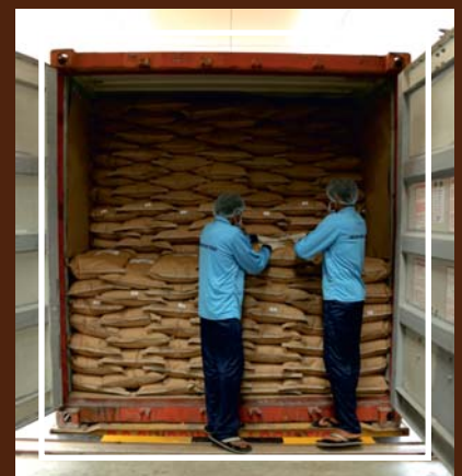
Loading & Stuffing