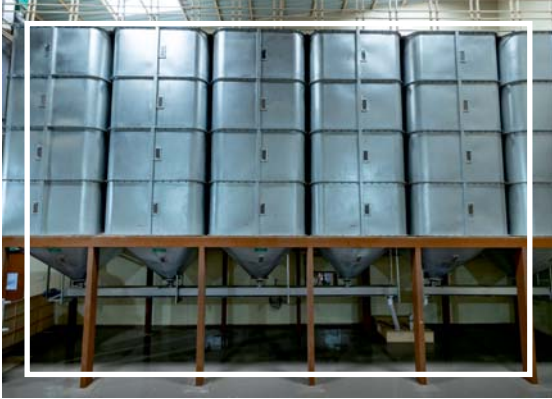
Raw Material Storage