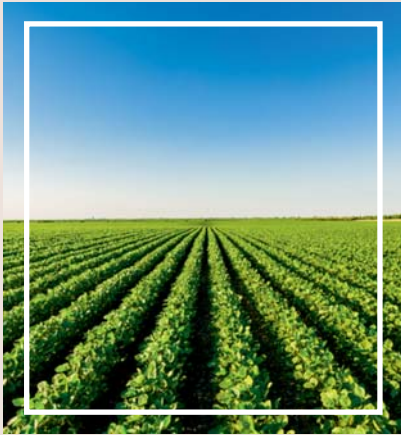
Farm Audit & Procurement