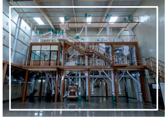
Sortex Cleaning Plant