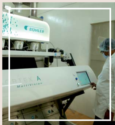
Trichromatic colour Sorting