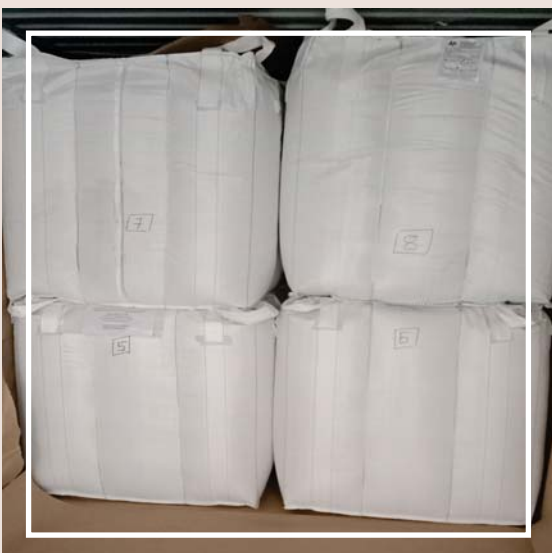
Big Bags Loading

Packaging is of prime importance in the case of food products. Our aim is to give the end-user a fresh product. We take utmost care to ensure that our products remain free from contamination and leakage.