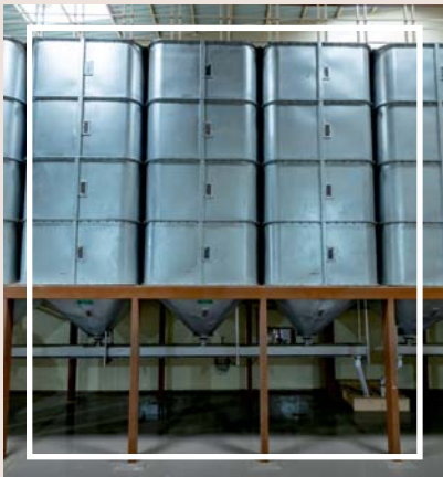
Raw Material Storage