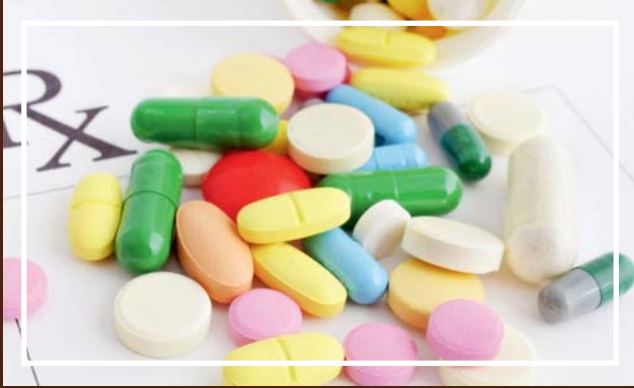
Pharmaceutical & Nutraceutical Industry