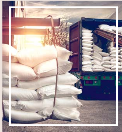
Incoming/ Inward goods